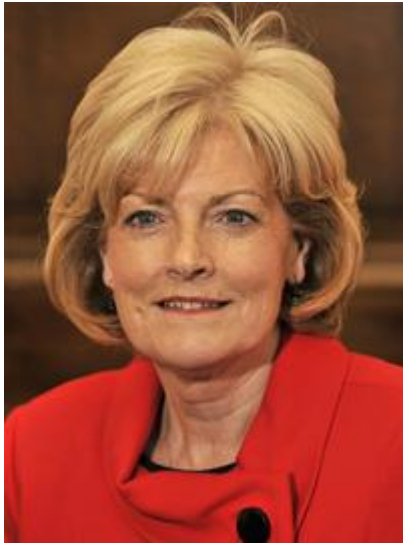
CABINET MEMBER – TRANSFORMATION AND RESOURCES